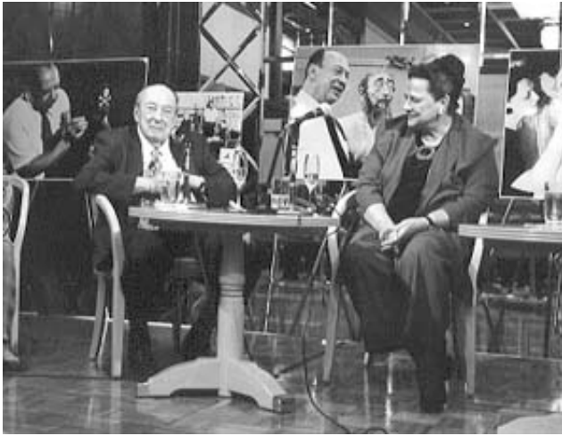
Mr.and Mrs. Davis

Mr. Mark Davis, a legendary animator at Disney Studio, and his wife visiting Japan.